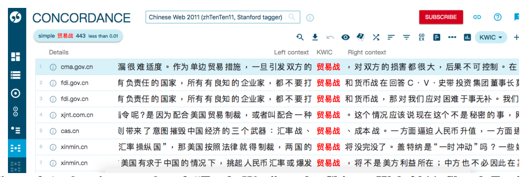
Figure 9 Authentic examples of "Trade War" on the Chinese Web 2011, Sketch Engine

A corpus is a handy tool for teachers when they prepare their lesson plans. For instance, it allows teachers to extract authentic examples of the usage of a lexical item, which provides a more objective view of language use than that of pure intuition or introspection. In addition, the corpus can also retrieve good dictionary examples and help teachers select the optimal usage examples. Teachers can also get statistical information from corpora that provide informative evidence for accurate word choice. It can successfully help teachers be more confident in advising students on word usage because of the informative evidence on the word's semantic features, contextual forces, and Chinese's regional variations.