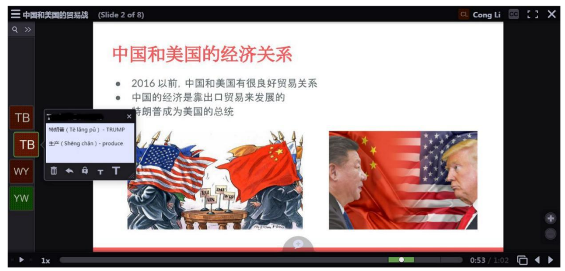
Figure 3 Presenters Attached a Vocabulary List by Adding Comments to a Slide