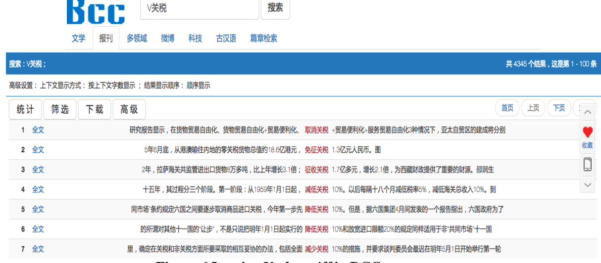
Figure 6 Inquiry Verb+tariff in BCC corpus

Yeh and Zhang's study (2018) suggests that the use of a corpus helped students improve their storytelling abilities. The use of a corpus allows the student to understand semantic and pragmatic features, and also grammatical characteristics, such as the common collocating words based on the context in which the word is used. For instance, when the two students were preparing their presentation on the US-China trade war, they learned how to use the corpus tool to improve their successful choice of words to describe the wave of tariffs by searching "Verb+tariff" in BCC corpus to find the appropriate collocating verbs. In Figure 1, the corpus shows a list of examples of using "tariff" as an object, such as "canceling the tariff" [取消关税], "levying the tariff" [征收关税], and "lowering the tariff" [减少关税]."