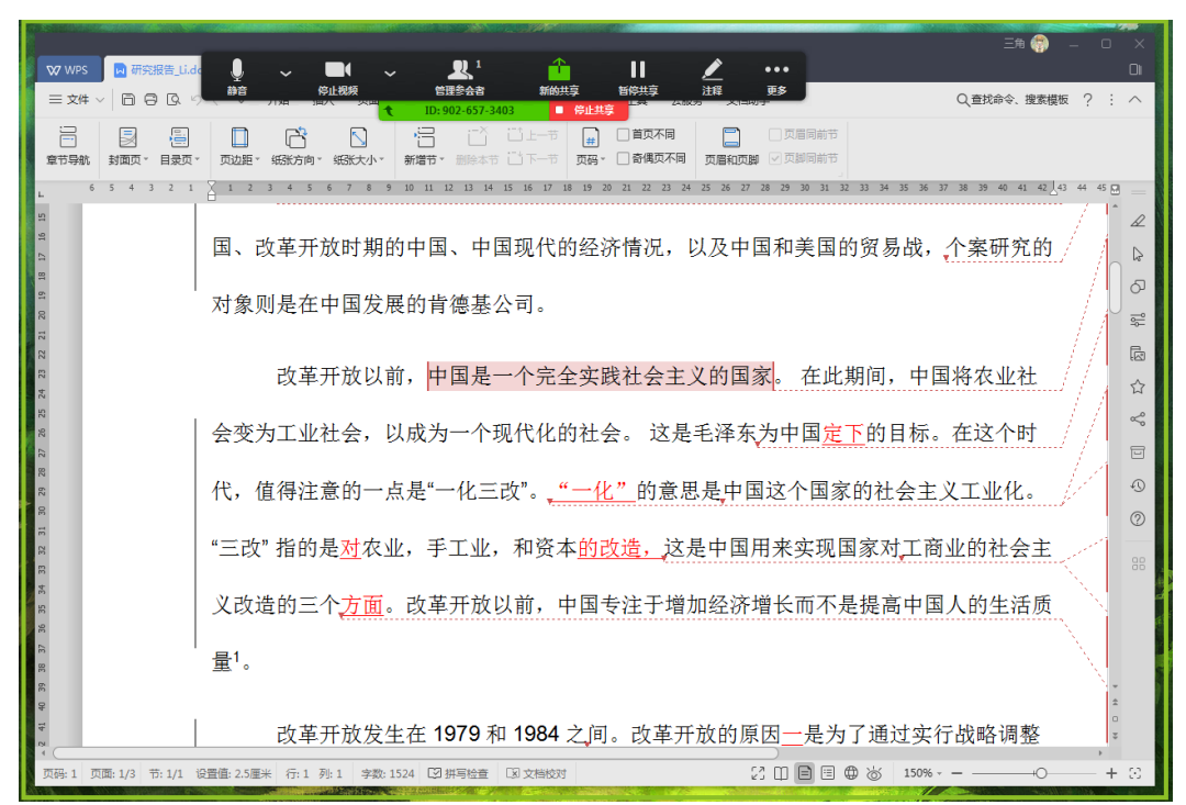
Figure 1 Using Screen Sharing to Discuss a Learner's Report (the outer green frame indicates the software being shared)

The virtual whiteboard can be utilized in either individual or group sessions when the instructor invites every participant to contribute to the group class discussion. In the example below, the instructor started a group session by activating the virtual whiteboard and inviting learners to provide some keywords that they remember after watching others' presentations. Participants can either type or draw their answers. They can choose different colors to avoid confusion. With the virtual whiteboard, instructors can design more collaborative activities in a distance learning environment. The following figure is an example of how the virtual whiteboard is used in this distance learning course.