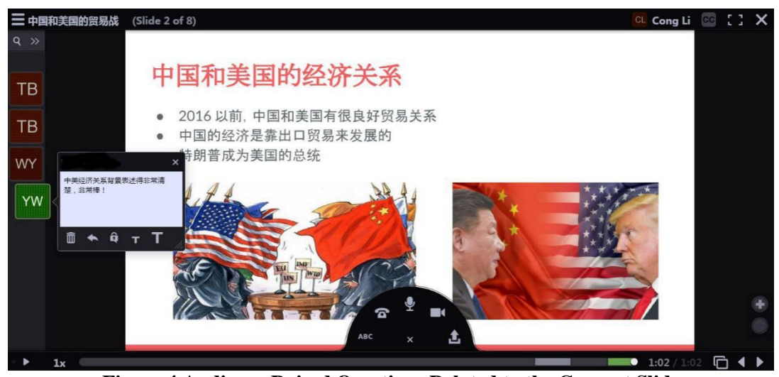
Figure 4 Audience Raised Questions Related to the Current Slide